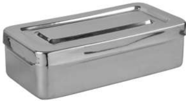
SURGICAL INSTRUMENT BOX