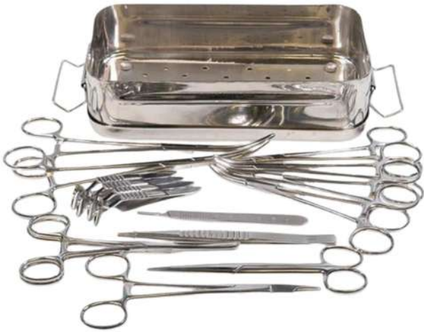
GENERAL SURGERY INSTRUMENT KIT