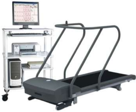
STRESS TEST SYSTEM