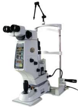
OPHTHALMIC YAG LASER