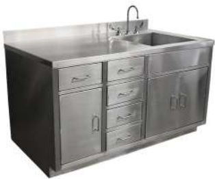
CABINETS AND SINK