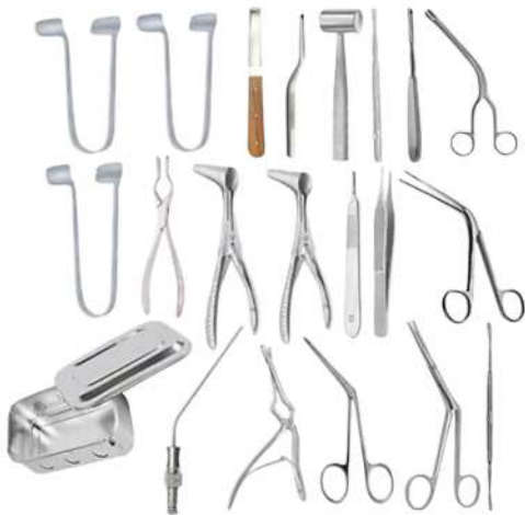
ENT SURGICAL INSTRUMENT KIT