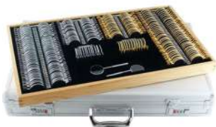
TRIAL LENS SET