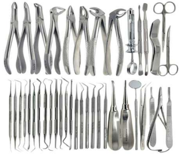
DENTAL INSTRUMENT KIT