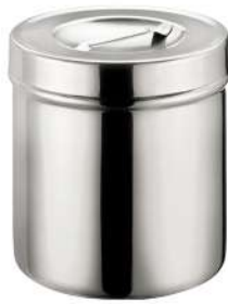
DRESSING COTTON JAR