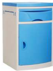
BED SIDE CABINET