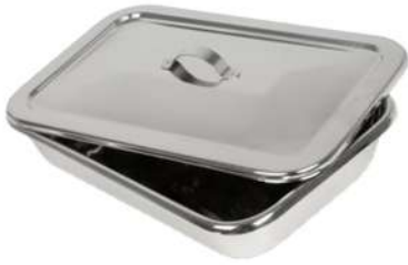
SURGICAL INSTRUMENT TRAY WITH LID