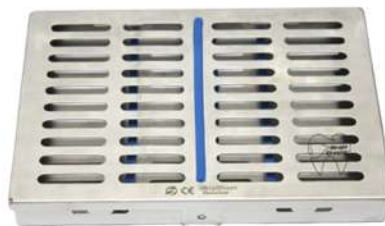
STERILIZATION CASSETTE TRAY