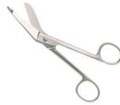
LISTER BANDAGE SCISSORS