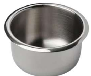
STAINLESS STEEL CALLIPOT