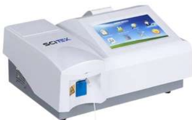
CHEMISTRY ANALYZER SEMI AUTO