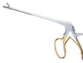
BIOPSY PUNCH FORCEPS