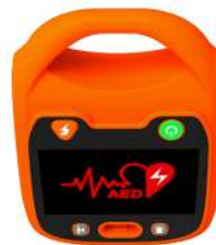
UTS AED MACHINE