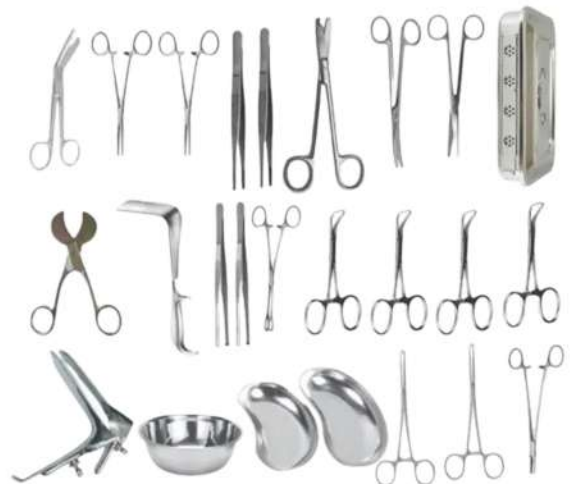
CESAREAN INSTRUMENT KIT