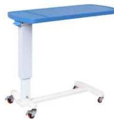
OVER BED TABLE