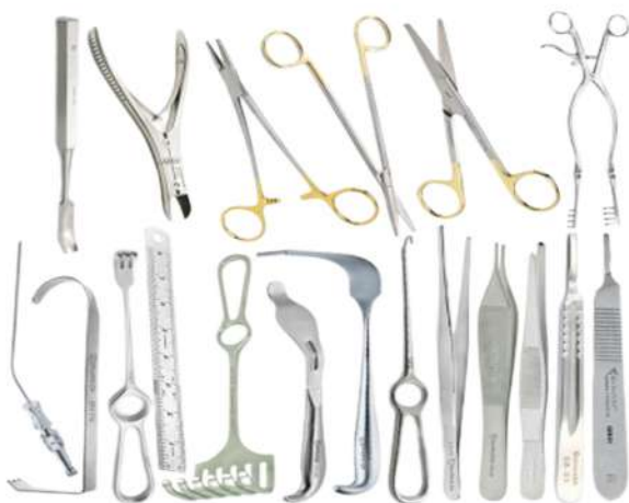
ORTHOPEDIC INSTRUMENT KIT