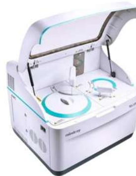
FULLY AUTO BIOCHEMISTRY ANALYSER