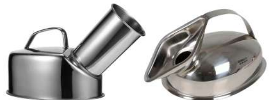
MALE & FEMALE URINAL JAR