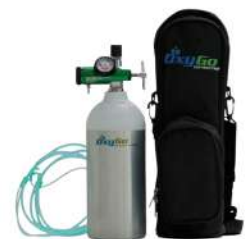
PORTABLE OXYGEN CYLINDER