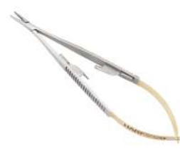
CATROVIEJO NEEDLE HOLDER