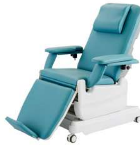
BLOOD DONOR CHAIR