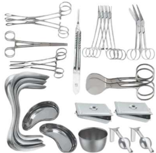
GYNE INSTRUMENT KIT