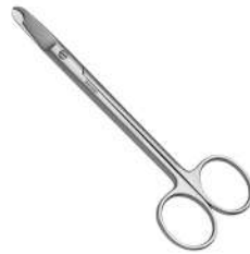
SPENCER STITCH SCISSORS