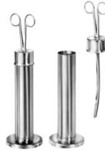
CHEETAL FORCEPS WITH JAR