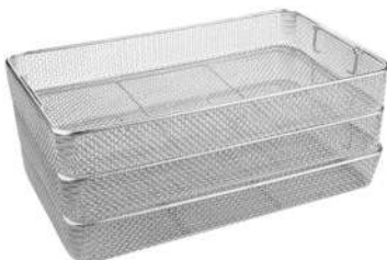
MESH TRAY & BOXES